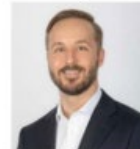
PRESENTED BY TODD LUTTMERS KEYSTONE PRIVATE WEALTH